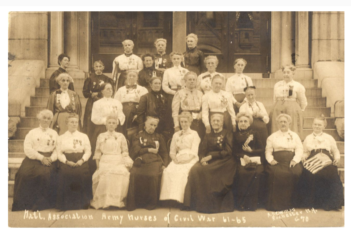
Postcard, ca. 1911.

In June 1881, Former Superintendent of Army Nurses, Dorothea Dix, founded the Ex-Nurses Association of the District of Columbia. The Association was primarily a social organization tasked with rendering assistance to its members, and working to secure Federal benefits and recognition for Union Army nurses. The group met annually, and also attended the encampments of the Grand Army of the Republic.