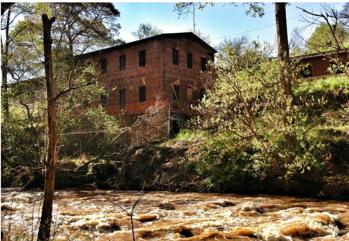
Ruins of a Roswell Mill

SWCW 2024 Conference - Society for Women and the Civil War