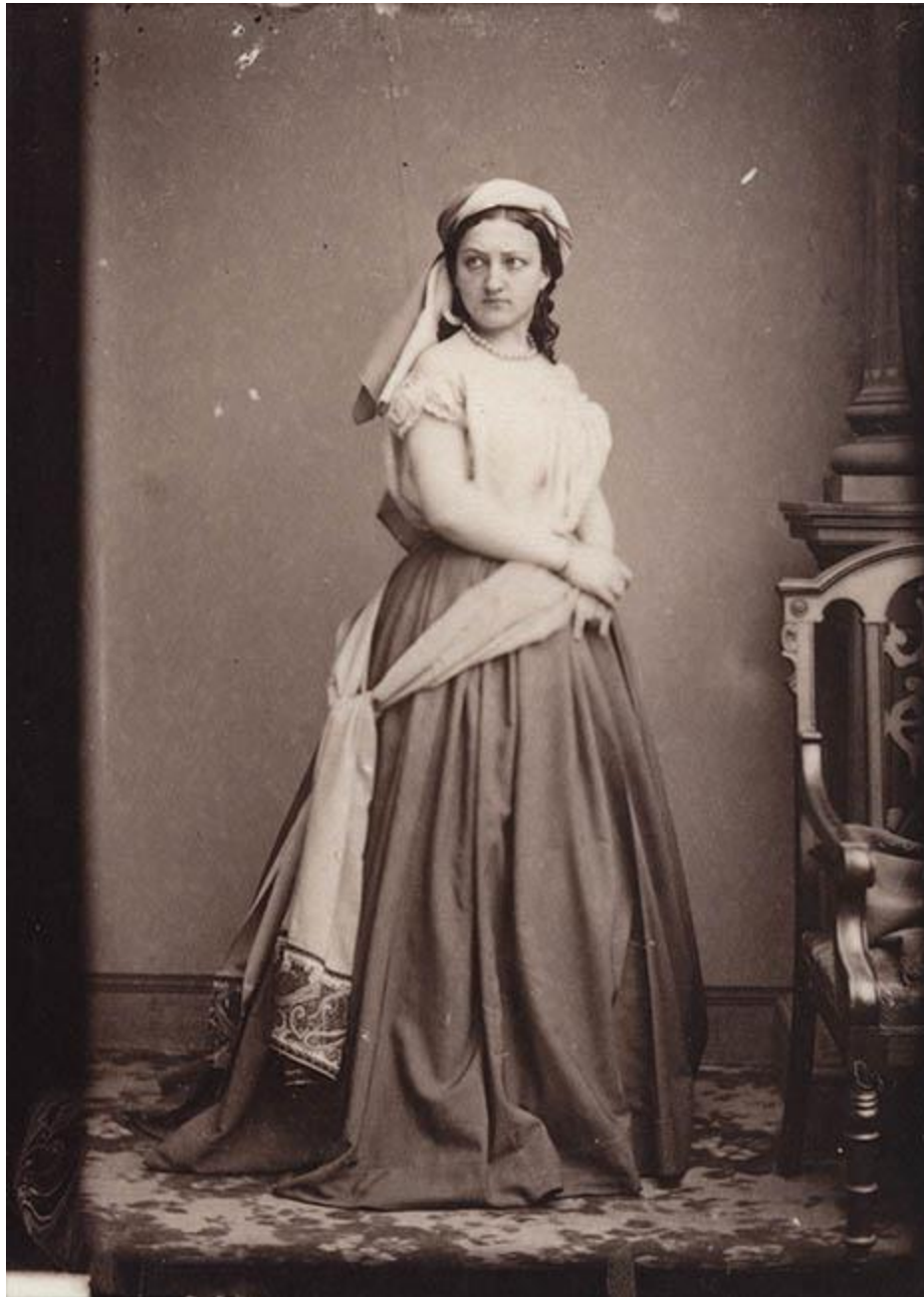
Kate Bateman, actress. Mathew Brady Studio. Modern albumen silver print from 1863 wet collodion negative.