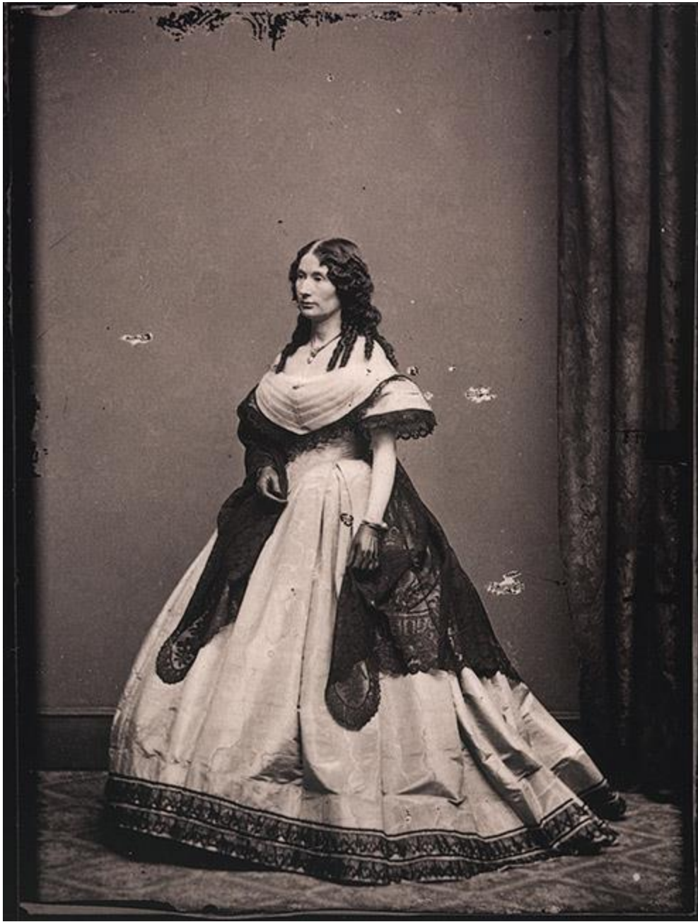
Laura Keene, actress. Mathew Brady Studio. Modern albumen silver print from c. 1865 wet collodion negative.