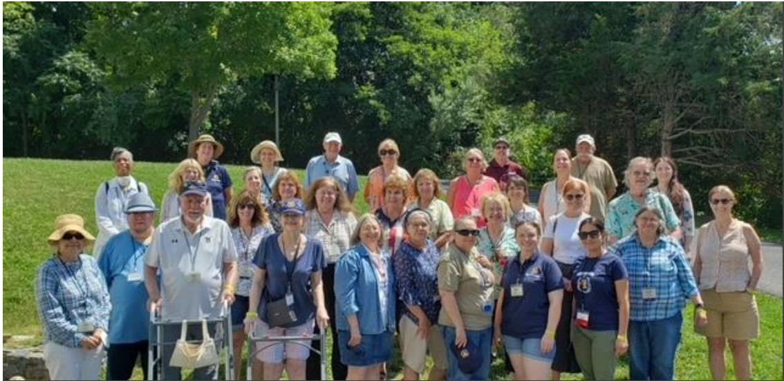
2022 Conference attendees at the Frontier Culture Museum in Staunton, Virginia