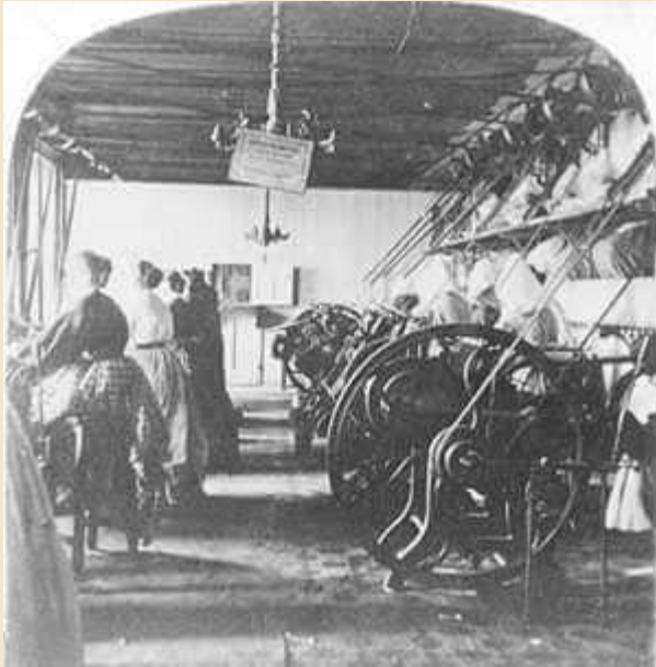
Women Working in the U.S. Treasury Department, Civil War