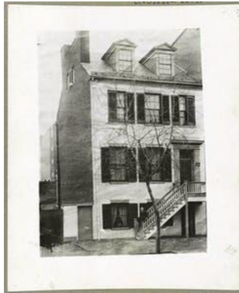
Mary Surratt's Boarding House