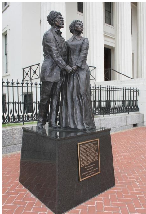
Harriet and Dred Scott Memorial, St. Louis, Missouri

The Committee solicits input for this database: identification of the site; the honoree; the location of the site; and the sponsor of the site, if known (along with contact information). A photo or other imagery would be much appreciated as well. Information will be happily received addressed to the attention of the committee at SWCW's email address – swcw1865@gmail.com .