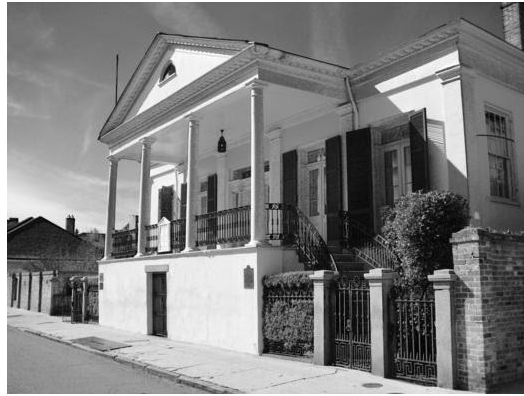
The Beauregard-Keyes House in New Orleans, reportedly haunted by the spirits of Gen. P. G. T. Beauregard, his family and staff