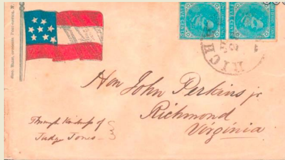
Letter smuggled to a CSA Congressman in Richmond from his wife in US Army-occupied New Orleans, 1863.