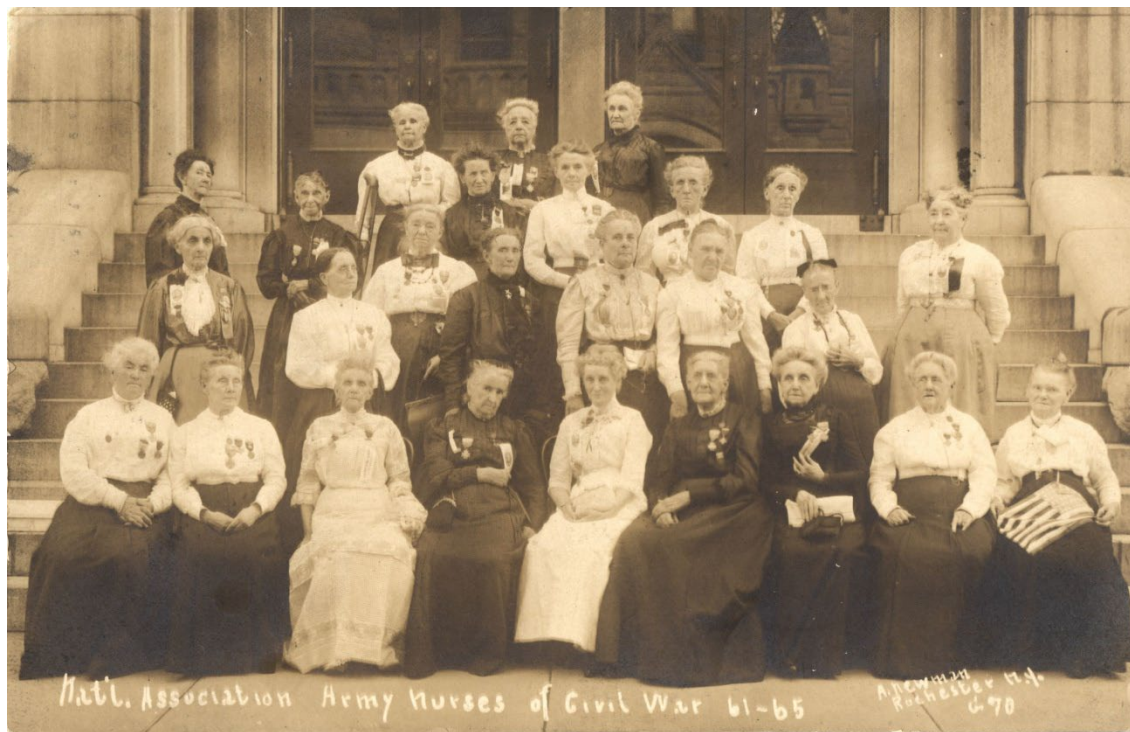
Postcard, ca. 1911.

In June 1881, Former Superintendent of Army Nurses, Dorothea Dix, founded the Ex-Nurses Association of the District of Columbia. The Association was primarily a social organization tasked with rendering assistance to its members, and working to secure Federal benefits and recognition for Union Army nurses. The group met annually, and also attended the encampments of the Grand Army of the Republic.