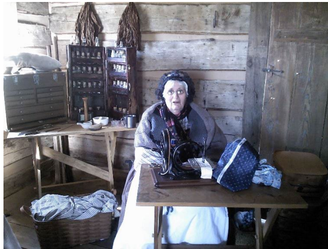
PALAS Using 19th Century Sewing Machines

For more information about the weekend, please see