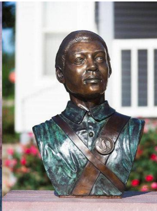
Monument to Cathay Williams