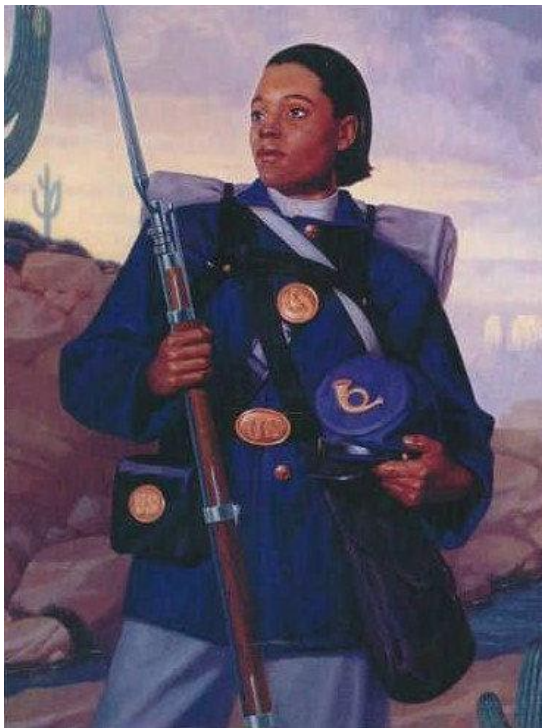
Fictional portrait of Williams

first documented African-American woman to enlist in the US Regular Army